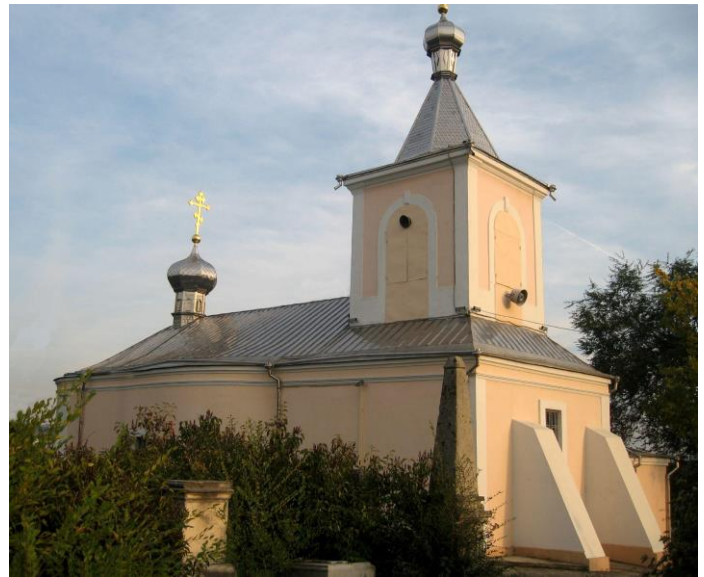
Fig. 4. The plan of the bastion fortress and the image of the “Constantine and Elena Church” (after Ciocanu, 2016)

The series of portable artifacts includes a whole series of funerary stones and monuments that belonged to notorious personalities of Chisinau in the 19th - early 20th centuries. Today, these vestiges are chaotically gathered around the “Saints Constantine and Elena” Church, having been displaced in the 70s of the 20th centuries from their original place, in the context of the Holbocica park development project, which was no longer accomplished. These pieces deserve to be analyzed, historically contextualized, some of them require conservation and restoration interventions, and later placed in the cemetery space as a result of a historical study on the structure of the cemetery and the layout plan of the archaeological park.