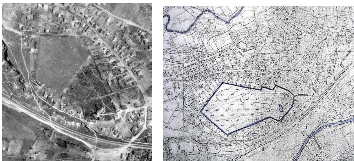
Fig. 2. Aerial photo (1944) and plan of the Visterniceni cemetery (1942) (after Ciocanu, 2016)

At the same time, on the surface of the archaeological site Chisinau - Saints Constantine and Elena Church is located the Cemetery with the monument complex from the 18th-20th centuries , registered in the Register of historical monuments protected by the state in the category of national monuments with no. 185 (Fig. 2) 1 . The site represents, for the most part, the hearth of the estate, later of the village of Visterniceni attested from the medieval period (17th-18th centuries), where the stone church dedicated to the Saints Constantine and Elena was built. The wall church, on the site of the wooden church dedicated to the Resurrection of the Lord 2 .