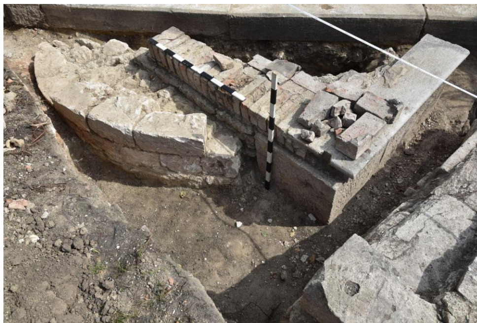
Fig. 5. Traces of the Catargi family vault (Musteață, 2022)

From the series of other vestiges, we could mention the traces of graves and foundations of funerary monuments that were part of the cemetery, but which were demolished in the 20th century. Recent archaeological research has demonstrated that the traces of the vaults can be recovered and exploited.