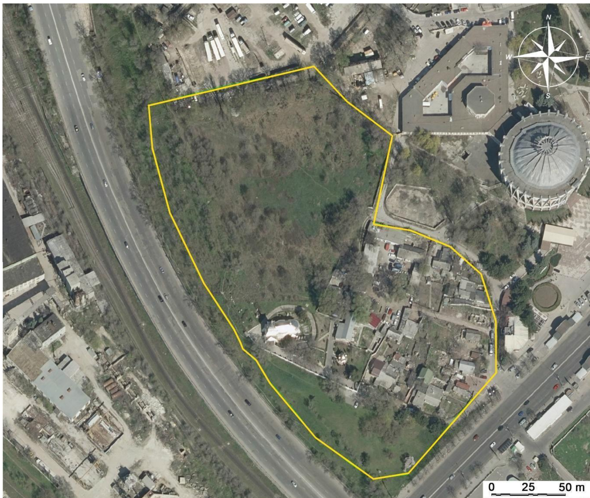
Fig. 1. The settlement of “Chisinau - Constantine and Elena Church”

In the area of the future Archaeological Park, a pluristratigraphic archaeological site, known in the specialized literature with the name “Chisinau - Constantine and Elena Church” (Fig. 1), on the surface of which traces of human settlement from the Mesolithic era (10000-6000/5000 BC), traces of habitation from the Bronze Age (New culture (XIV century -XIII BC) and traces from the early medieval period (Lozna-Dodești-Hanska culture, VIII-IX centuries), which were attested by archaeologists N. Golițeva, T. Șcerbakova in 1975, and by I. Borziac in 1986.